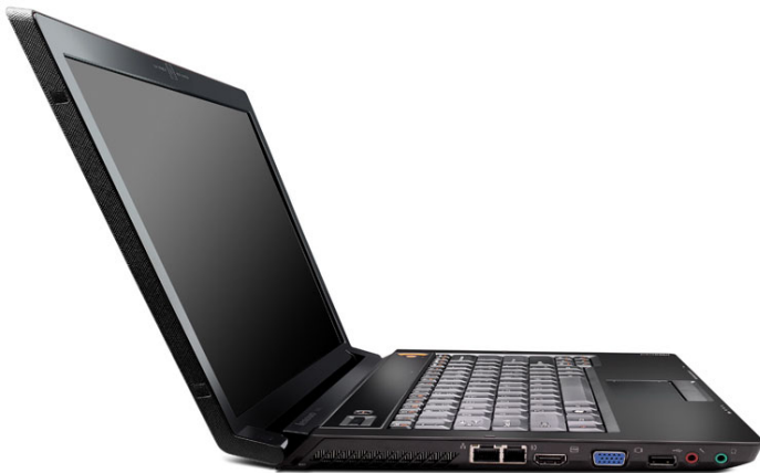
Lenovo IdeaPad Y430