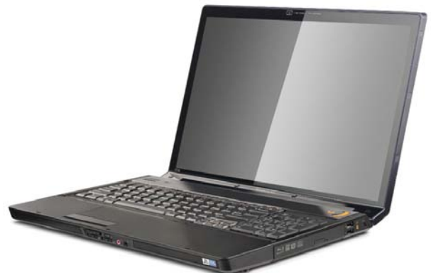
Lenovo IdeaPad Y710