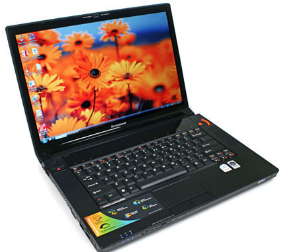
Lenovo IdeaPad Y510