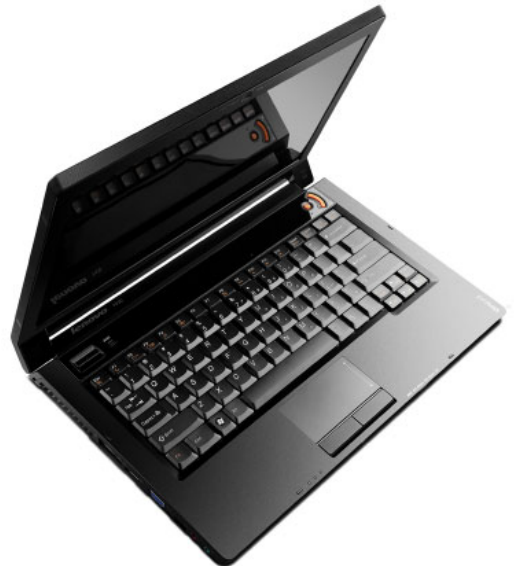
Lenovo IdeaPad Y430