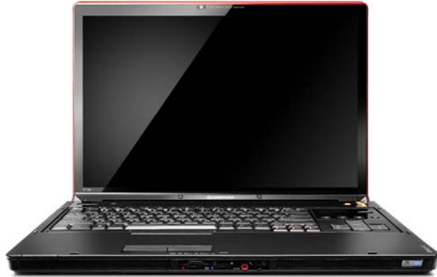
Lenovo IdeaPad Y730 Valencia Orange