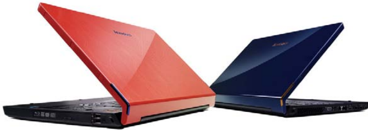
Lenovo IdeaPad Y730