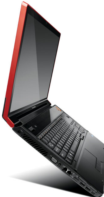
Lenovo IdeaPad Y730 Valencia Orange