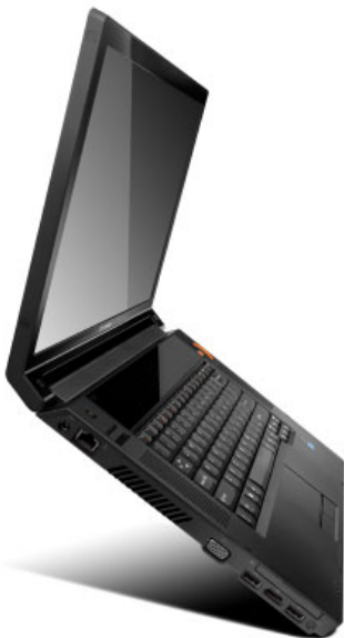
Lenovo IdeaPad Y530