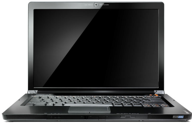
Lenovo IdeaPad Y430