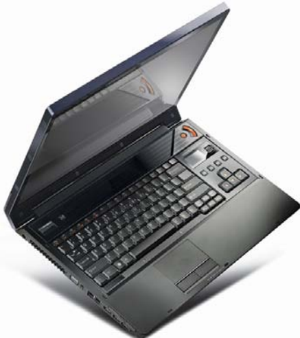
Lenovo IdeaPad Y710 (Game Zone on select models)