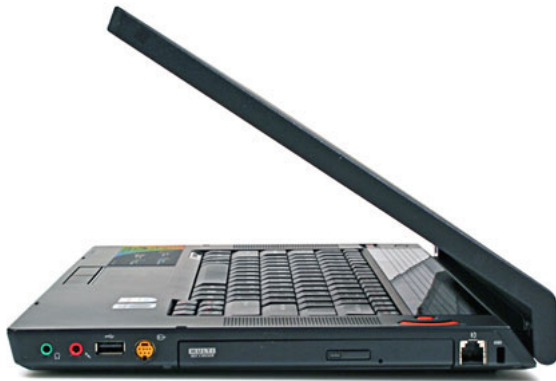
Lenovo IdeaPad Y510