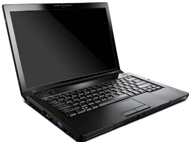
Lenovo IdeaPad Y430