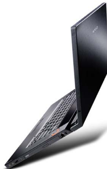
Lenovo IdeaPad Y530