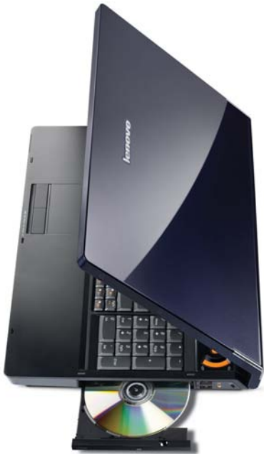
Lenovo IdeaPad Y710