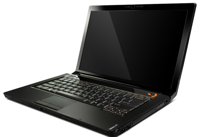
Lenovo IdeaPad Y430