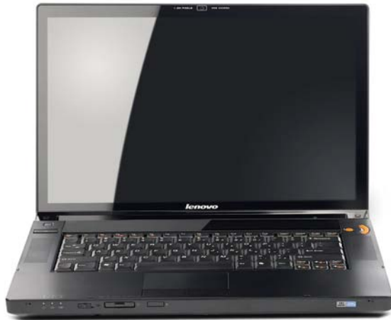
Lenovo IdeaPad Y510