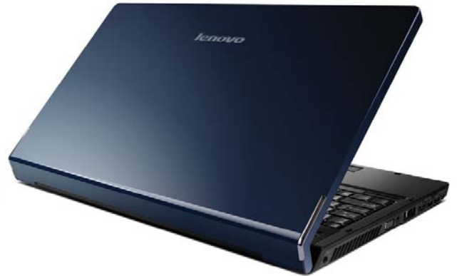
Lenovo IdeaPad Y730 Indigo Blue