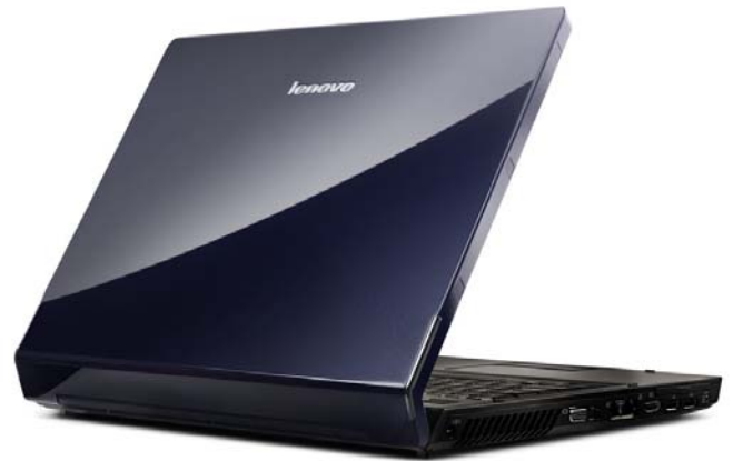
Lenovo IdeaPad Y710