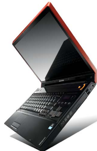
Lenovo IdeaPad Y730 Valencia Orange