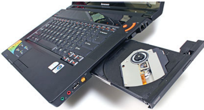
Lenovo IdeaPad Y510