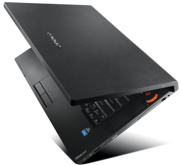
Lenovo IdeaPad Y530