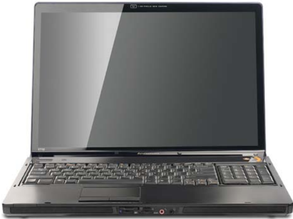
Lenovo IdeaPad Y710