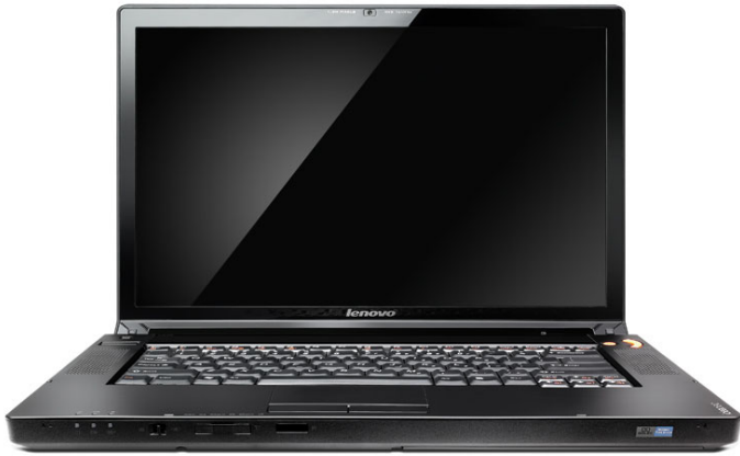
Lenovo IdeaPad Y530