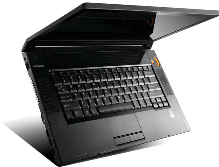
Lenovo IdeaPad Y530