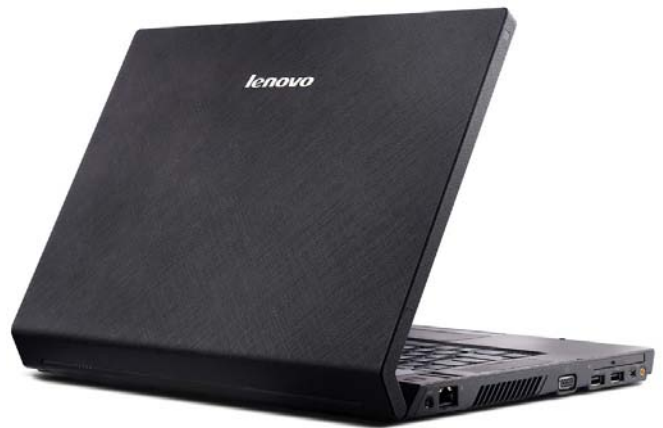
Lenovo IdeaPad Y510