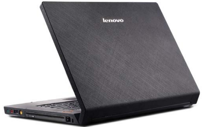
Lenovo IdeaPad Y510