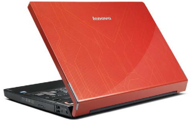
Lenovo IdeaPad Y730 Valencia Orange