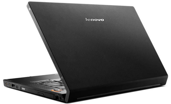
Lenovo IdeaPad Y530