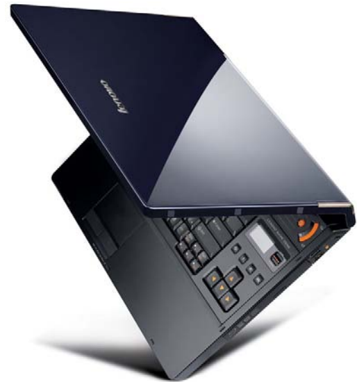
Lenovo IdeaPad Y710 (Game Zone on select models)